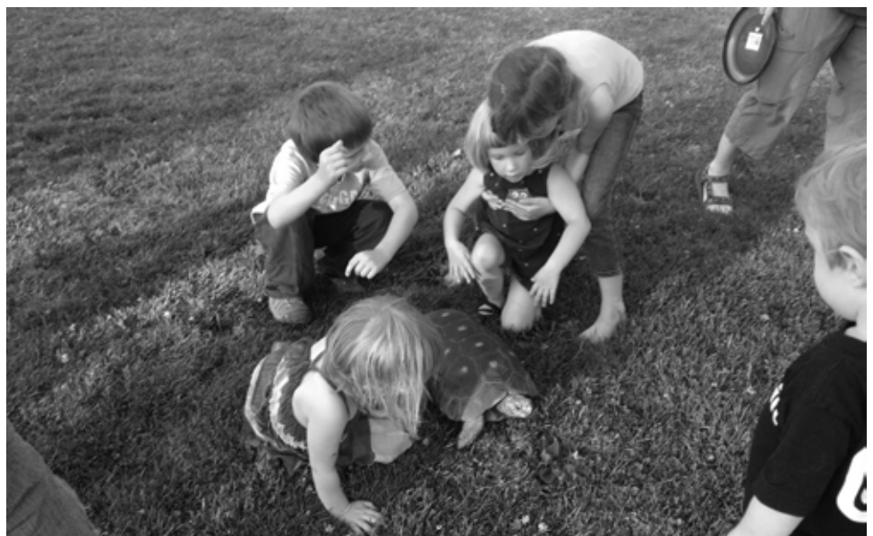
Neighborhood children get to know a neighborhood tortoise at the Planet of the Dinosaurs movie in the Sewallcrest Park.

Any opinions expressed, unless specified, are not necessarily those of the Sunnyside Neighborhood Association or its board. Sunnyside residents are welcome to submit articles for consideration that concern neighborhood issues, by emailing board@sunnysideneighborhood.com . Many wonderful volunteer Sunnyside residents distribute the Neighborhood News.